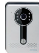
SURFACE MOUNT DOOR STATION