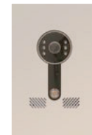
FLUSH MOUNT DOOR STATION