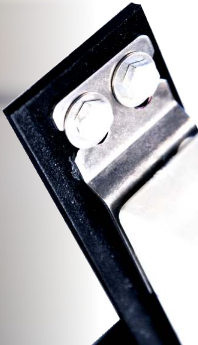
secure key locking device