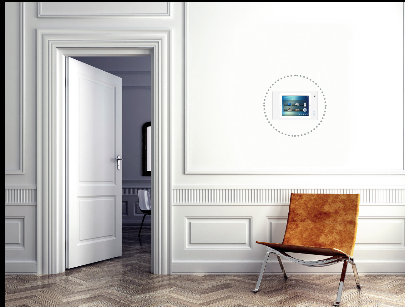
iRoom's iDock Touchcode white

No matter what your wall looks like, we have the perfect docking solution!